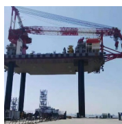
ZPMC Marine Platf